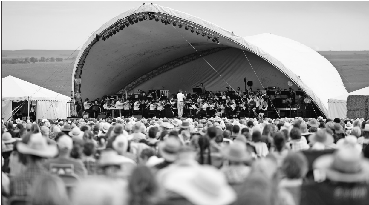
PERFORMING THE FINAL 'GRAND FINALE' - The Kansas City Symphony performed Saturday, June 14 in a pasture just northeast of Strong City as part of the Symphony in the Flint Hills' "Grande Finale." Except for 2019 due to weather and 2020 due to COVID, the event has happened every June since 2006.