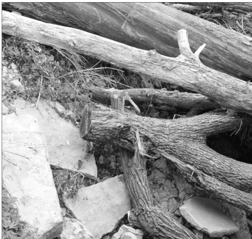
IRRESPONSIBLE LOGGING PROCEDURES . . . have caused headaches for the road and bridge workers in the Morris County Public Works Department. Note: the saw-cut walnut limb that was left behind, only to become part of the problem downstream after our recent rains.