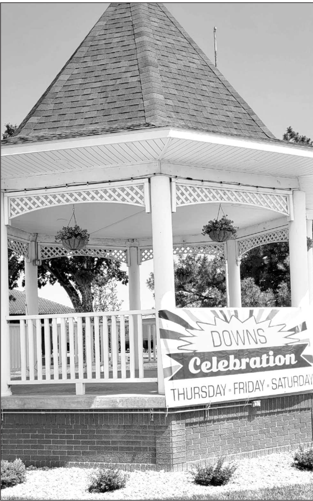
READY: The Gazebo in Railroad Park is decked out with a sign advertising the Downs Celebration.