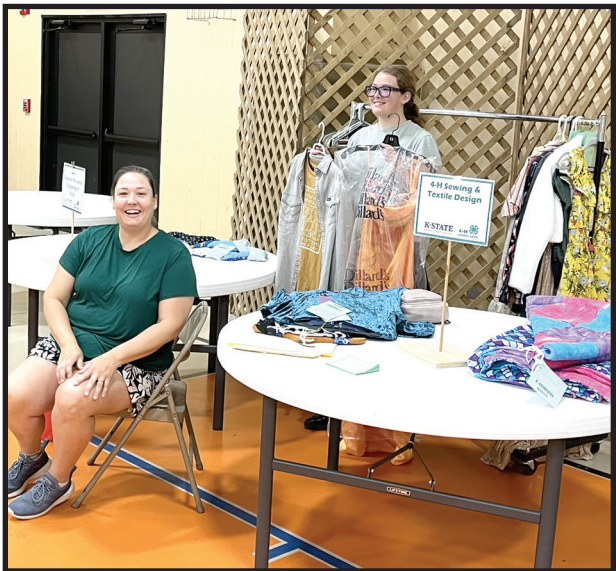
Clothing items over here, please.