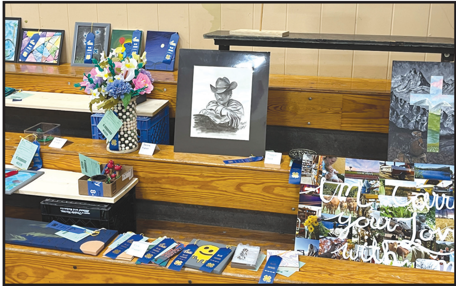
The entries are stacking up.