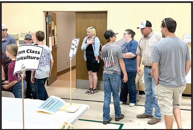
Entrants check in projects while families wait for judging results.