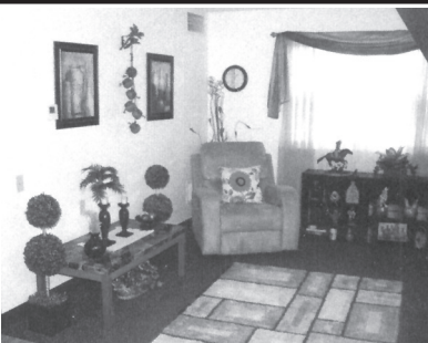
The Apartment complex pays water, sewer, trash, electric, and gas. A security deposit of one month's rent is required. One pet is allowed within regulations. A pet deposit is an additional $100.

(The Larned Housing Authority is a Non-Profit Corporation) Pawnee Plaza provides affordable housing. The project was completed in 1978, has been very well maintained, and is located at 1801 Broadway, Larned, KS . There are 40 one-bedroom apartments, four of our units are barrier free. Each apartment is furnished with stove, refrigerator, carpeting and window coverings. The Requirements for Tenancy are that the applicant or co-applicant be 62 years of age or older, handicapped or disabled. The applicant must also pass the screening process. Applicants are screened for