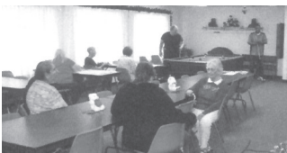
We also have a community room for our residents' enjoyment.

criminal history, sexual predator status, and previous rental history. The Applicant must meet HUD's income guidelines. The rent for the apartments is based on income. The rent is approximately 30% of the tenant's monthly income. Allowances are made for qualifying medical expenses in calculating the rent. HUD requires each household to pay a minimum rent of $25. Laundry facilities are available onsite.