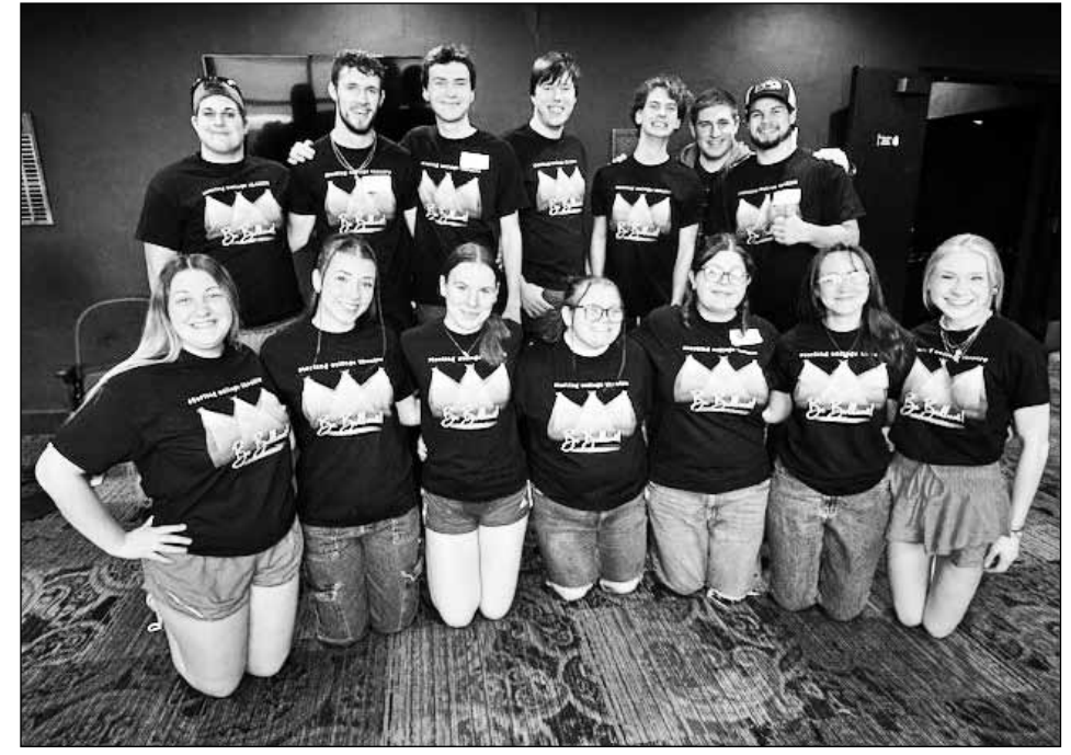
STERLING COLLEGE THEATRE students who assisted the 500+ high school students who attended the annual SC Theatre Workshop/Matinee last week. Each of the student assistants wore the new SC Theatre "Be Brilliant" T-shirt that day. A complimentary SC Theatre t-shirt was given to each high school student who attended the Workshops as well. The t-shirt project was funded through a grant from the Rice County Community Foundation and with support from the SC Enrollment Services Office.