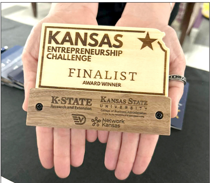
THIS PAST SPRING, Garvert supplied 40 plaques for the 2025 Kansas State Entrepreneurship Challenge.