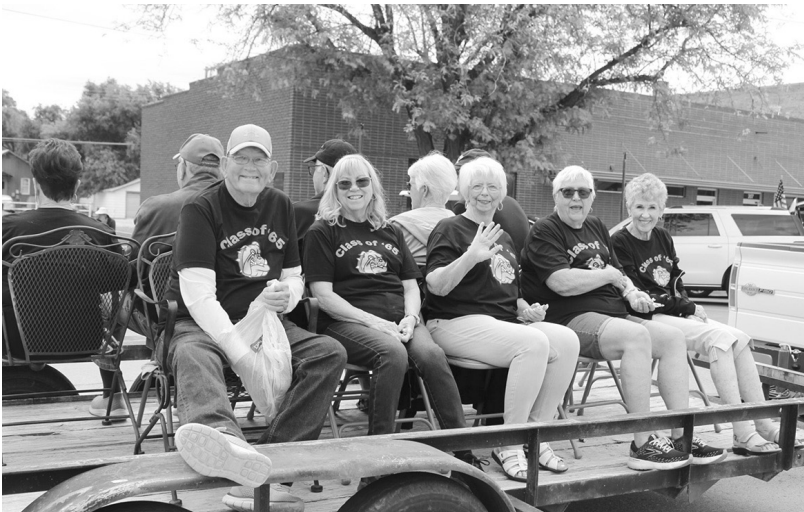
Class of 1965