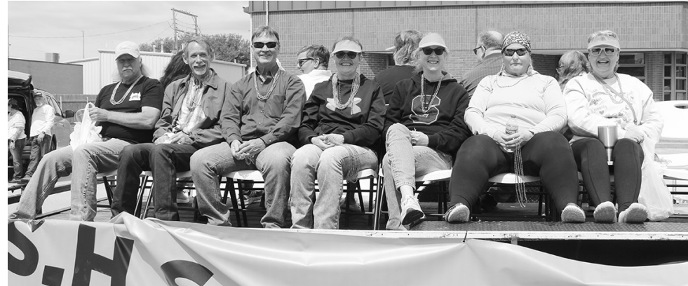
Above and below - SHS Class of 1980