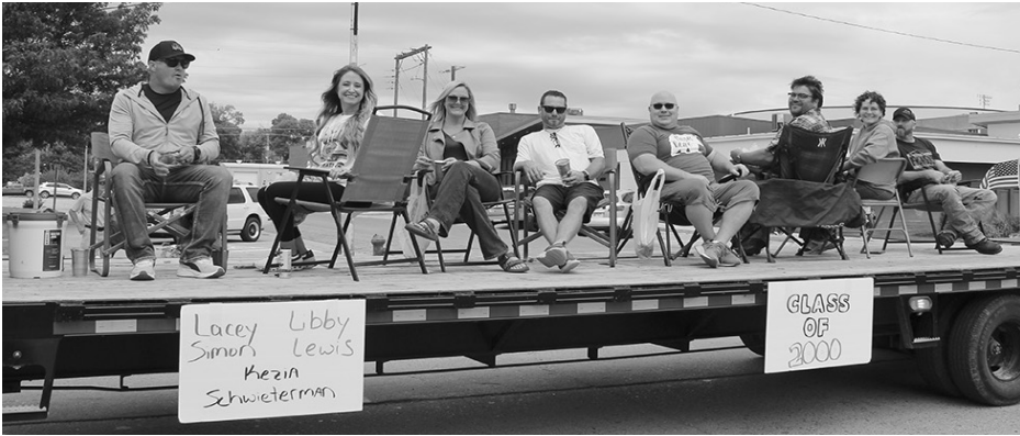
SHS Class of 2000