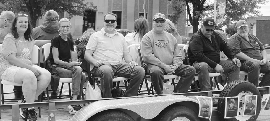
SHS Class of 1985