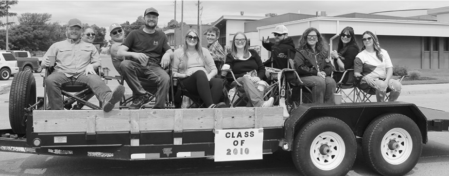
SHS Class of 2010