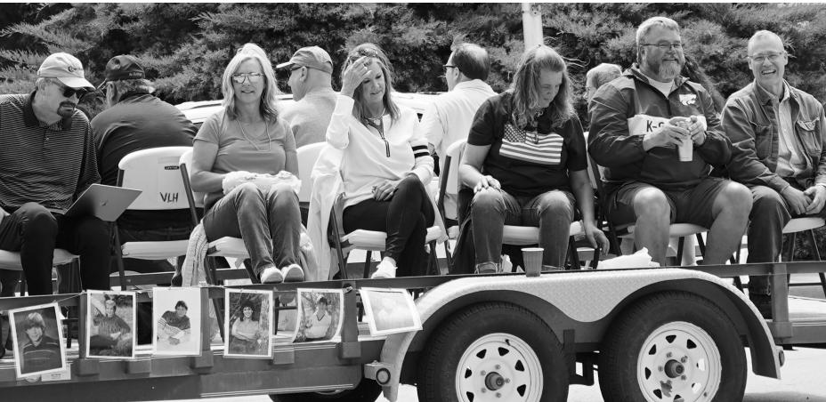
Class of 1985