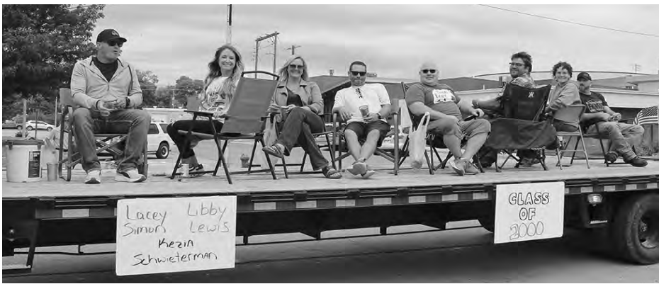
SHS Class of 2000