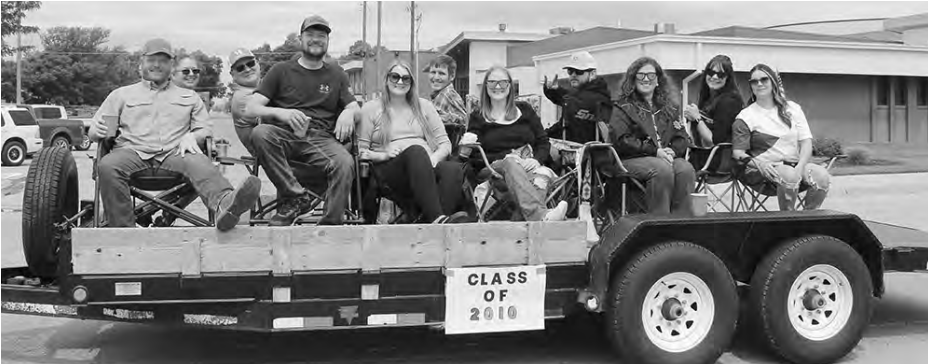
SHS Class of 2010