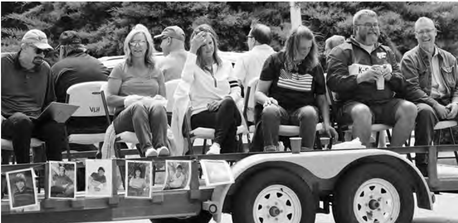
Class of 1985