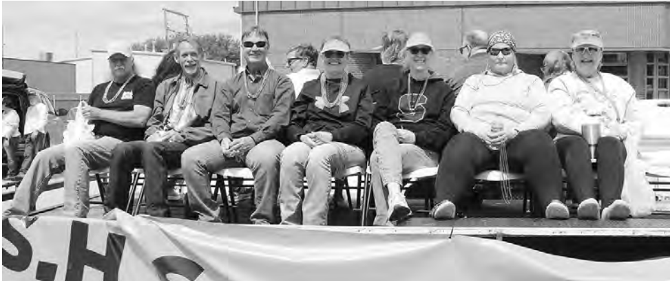
Above and below - SHS Class of 1980