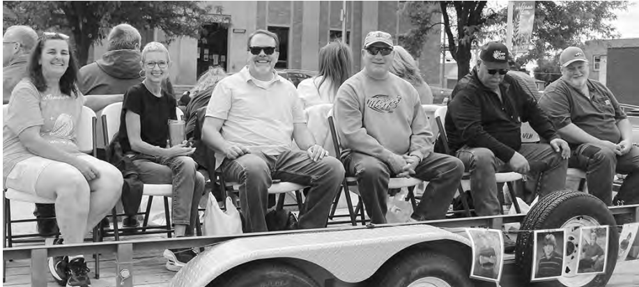
SHS Class of 1985