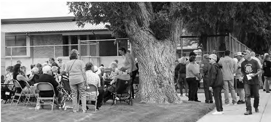
Alumni BBQ