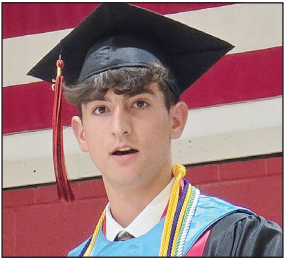
Lebo High School Graduation. Page 1B