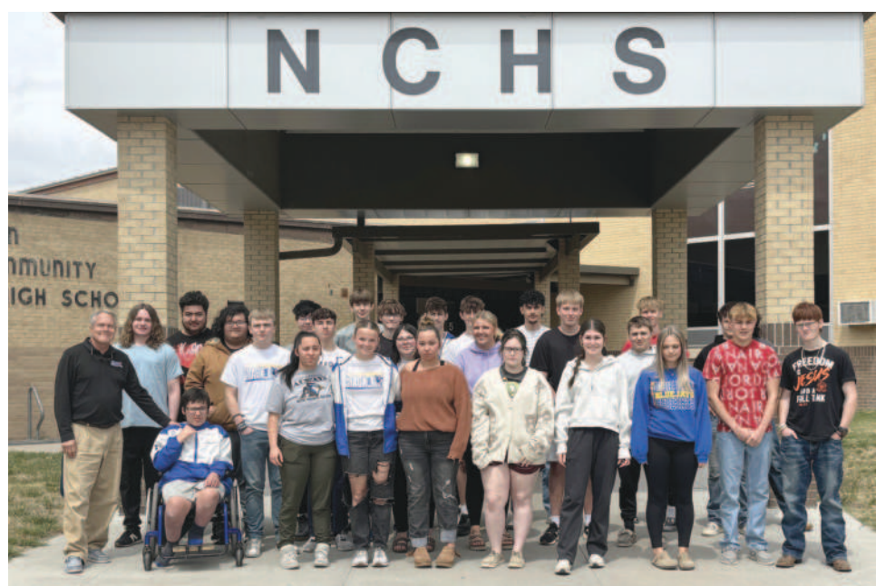
Norton Community High School students are working to bring a dog park to Veterans Park by next fall.