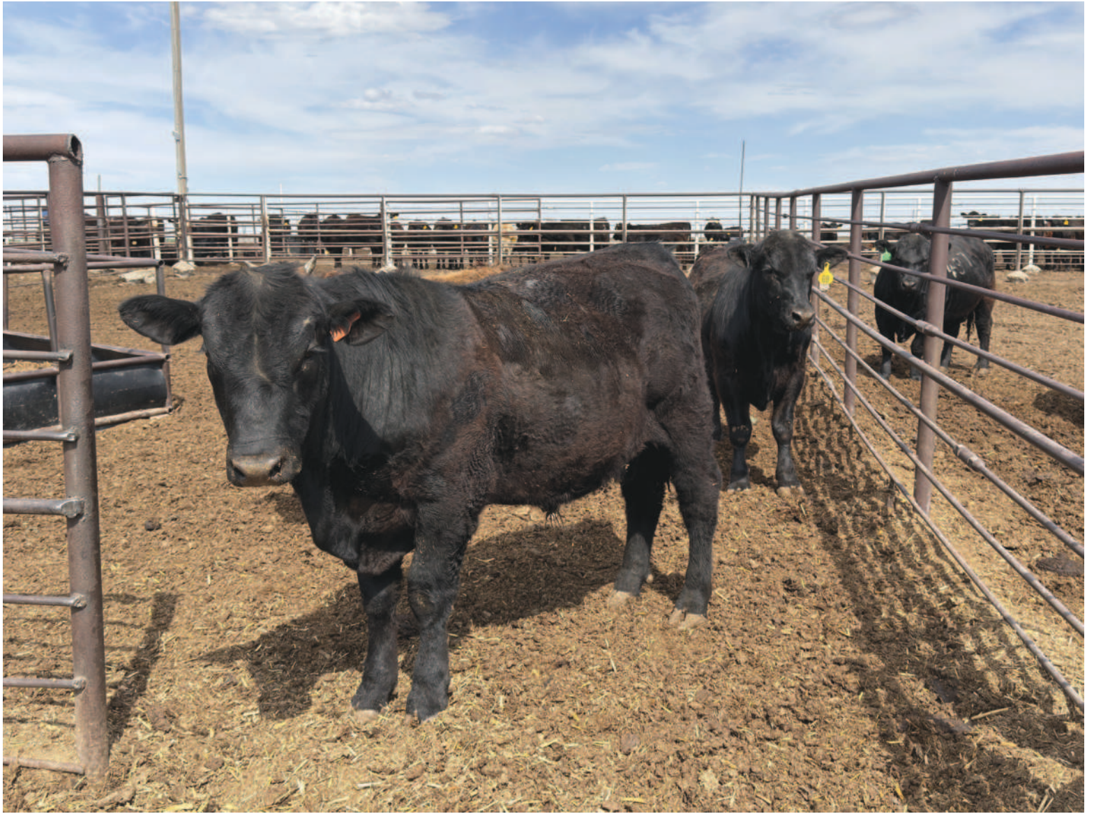
A Black Angus bull stands in a pen.

Medium and large fancy heifers sold from $341.50 to $695. Thin-fleshed heifers sold from $460 to $660. Unweaned heifers brought $320 to $525. Spayed heifers sold from $332 to $570, while replacement cattle brought $356.50 to $368. Large heifers weighing