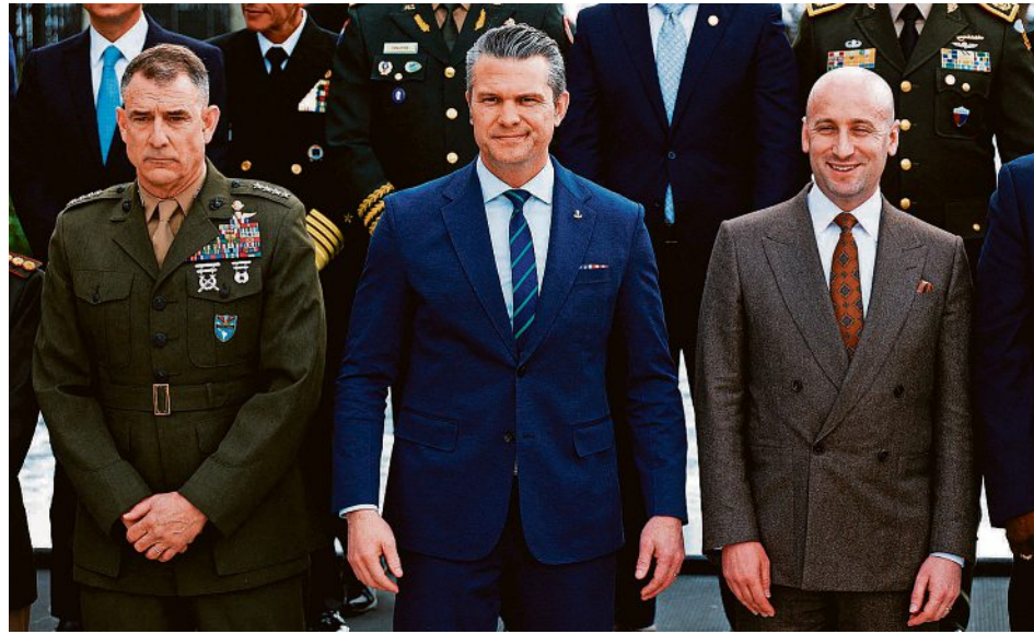
Pentagon chief Pete Hegseth, center, has compared drug cartels to terrorist groups like al-Qaida and said the boat strikes act as a deterrent to drug traffickers.

The Pentagon referred USA TODAY’s questions to U.S. Southern Command, which oversees military operations in South America and the Caribbean. The command said in a statement, “All operations are conducted deliberately and lawfully, in full compliance with U.S. and international law, including the law