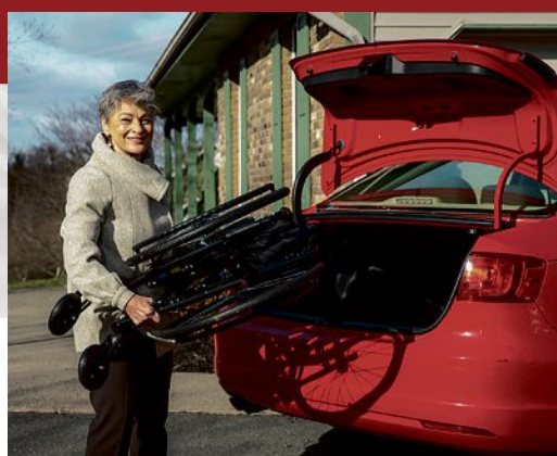
Easy to Transport and Store