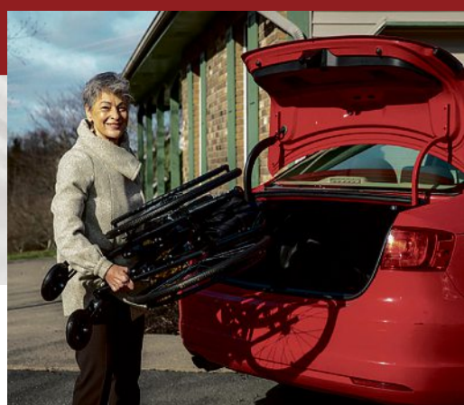
Easy to Transport and Store