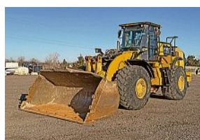
ES5909 '18 CAT 980M wheel loader