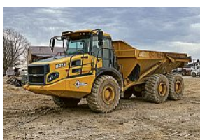
FC5031 '16 Bell B25E articulated haul truck