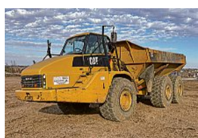
EA4467 '11 CAT 740A articulated haul truck