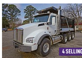
EB6492 '25 Kenworth T880 dump truck