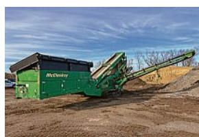
ET6975 McCloskey S130 2DT screening plant