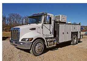
E07054 '19 Peterbilt 337 utility / service truck