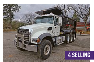
EB6496 '25 Mack Granite dump truck

INVENTORY INCLUDES: dump trucks, articulated haul trucks, directional boring units, forestry mulchers, crane trucks, excavators, screening plants, bucket trucks, skid steers, double drum vibratory rollers, service trucks, mini excavators, jaw crusher, backhoes, and more.