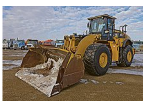
EB1319 '12 CAT 980K wheel loader