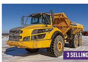
DW7490 '18 Volvo A40G articulated haul truck