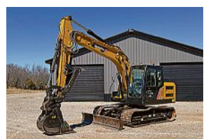
ES5898 '21 Sany SY135C excavator