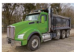
YA1559 '23 Kenworth T880 dump truck