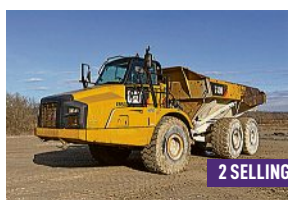
FB3081 '14 CAT 740B articulated haul truck